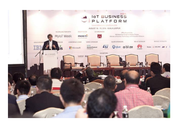
Speak or invite your clients to share existing case studies on the main stage