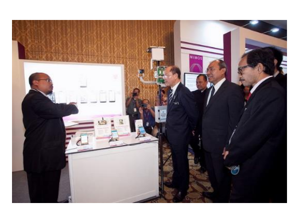
Demonstrate your technology or track record to attendees during coffee breaks