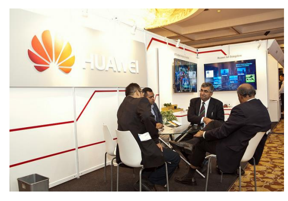
Conduct one-on-one meetings with selected attendees to explore partnerships and create opportunities