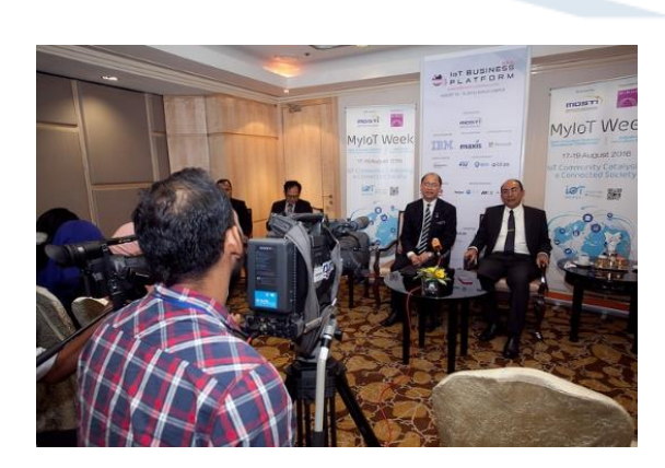
Share your insights with media and get exclusive interview coverage