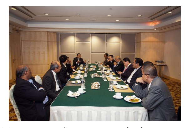
Host a private workshop or prospects or clients

For speaking and sponsorship opportunities, please contact: